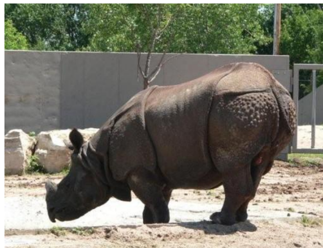
A hot Rhinoceros heading to the water hole.